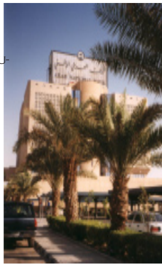
ARAB NATIONAL BANK

NATIONAL BANK OF KUWAIT KFAS THE HOME OFFICE ADELPHI PORT OF SOHAR SAGE, UK ZUBAIR CORPORATION