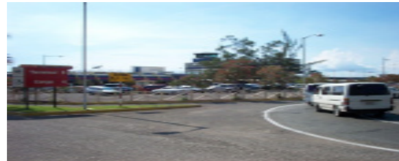
AIRPORTS AU- THORITY OF JAMAICA