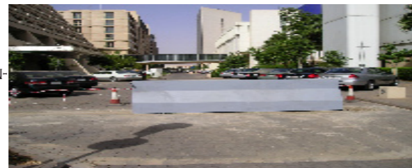
THE KING FAISAL FOUN- DATION