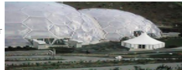
THE EDEN PROJECT